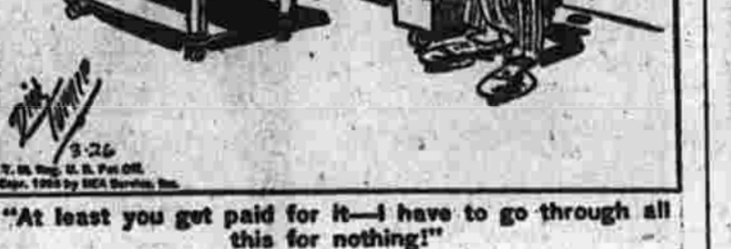
It's Just Possible