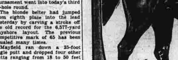
Country Club Opens; Tournament Dates

Following a week's postponement, the Manchester Country Club will officially open today, club officials announced yesterday. Last week's opening day was called off by a late March snowstorm.